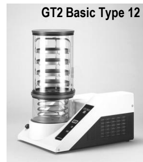
GT2 Basic Type 12

Pos.: 1, 3, 4, 8, 4x9, 4x12, 13, 3x14, 15