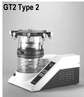
GT2 Type 2

Pos.: 2, 2x3, 4-7, 10, 11, 12, 4x14, 16, 8x18