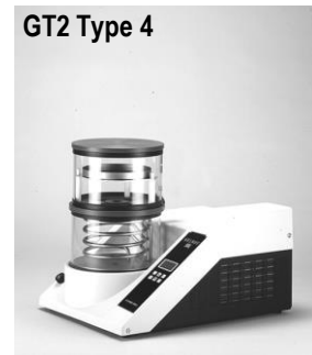
GT2 Type 4

Pos.: 2-6, 8, 4x9, 4x10, 11, 4x12, 13, 4x14, 16, 8x18