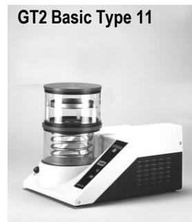
GT2 Basic Type 11