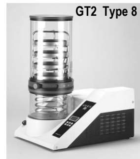
GT2 Type 8

Pos.: 2-6, 8, 4x9, 4x10, 11, 4x12, 13, 4x14, 15