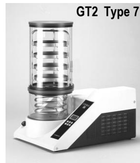
GT2 Type 7