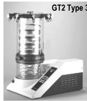
GT2 Type 3

Pos.: 2, 2x3, 4-7, 10, 11, 12, 4x14, 16, 8x18