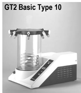
GT2 Basic Type 10