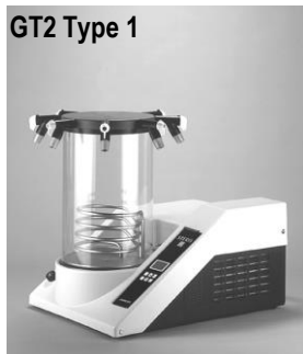
GT2 Type 1