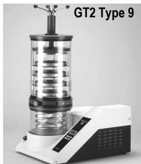
GT2 Type 9

Pos.: 2-6, 8, 4x9, 4x10, 11, 4x12, 13, 4x14, 15