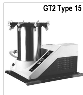
GT2 Type 15

The Types 13 und 14 are not available anymore.