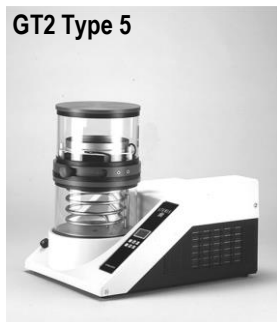
GT2 Type 5