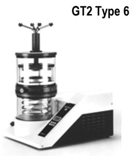
GT2 Type 6