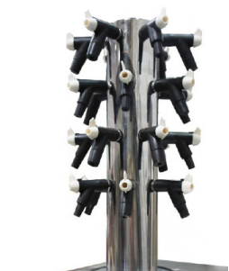
LSPM24 24-Port SS Drying Manifold

UK designed, manufactured and supported, the LyoDry Benchtop Pro offers a superior, keenly priced, freeze drying solution with enhanced functionality, ideal for freeze drying a wide variety of samples.